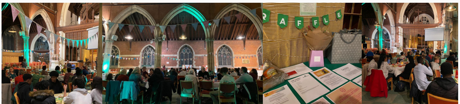
CAP Fundraising event & quiz, with raffle - including two tables of Youth!

The CAP Debt Centre at St Gabriel's has been incredibly blessed with abundantly generous donations. We want to thank all our CAP Angels, a family who gave a legacy, two local funds who have increased their commitment to us this last year, an extraordinary gift from a CAP Angel moving away and another CAP Angel who gave five years of donations in advance. In addition, a partner church held a ceilidh and a St Gabriel's member completed the Great North Run, both in aid of CAP - thank you! There has been a slight drop in the number of CAP Angels (14 to 11), but we continue to trust and believe that God will provide what we need, as we've seen Him do this year. Praise God!