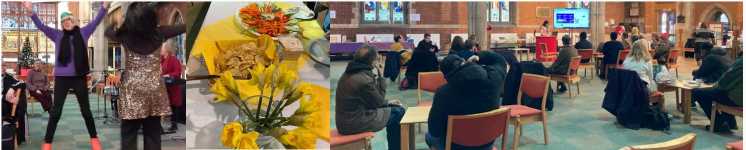
Christmas & Easter special Hope Cafe sessions; listening to a visiting speaker.

Since the initial trial of Hope Cafe in Spring 2022, we have been watching, learning, adapting and developing the concept and are delighted and astonished at the breadth of engagement achieved. Who knew that Monday afternoons could be so fruitful? We regularly have 50+ attendees. It has proved to be an entry point for people to build trust and connection and feel confident in asking for help. St Gabriel's members, including the CAP team, have assisted with listening, praying, making referrals to the food bank, helping with difficult online enquiries or admin, directing people to support available from the Local Authority or other organisations. CAP ran the Money Course at Hope Café and invited a range of speakers and visitors to share their expertise, advice and opportunities. These ranged from benefits, legal, pensions and rental matters to creative opportunities, from visitors including Advice4Renters, Ashford Place & The Kiln. The Hope Café Christmas and Easter Specials were valued & enjoyed by all attending, particularly across the local community, including some CAP clients.